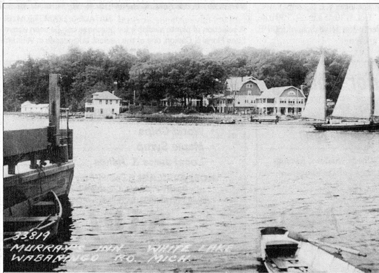
1928-41 circa - Murray's Inn from Lau Road

In June 1984, five of the former Murray's Inn buildings were converted into twenty-eight condo units which became known as Driftwood Dunes Condominiums.